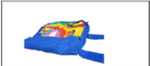
Step 2: Fold in one-fourth