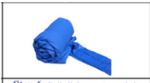
Step 6: Roll all the way toward air tubes