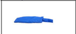
Step 4: Fold one part over the other part