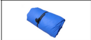
Step: Tie tight with straps