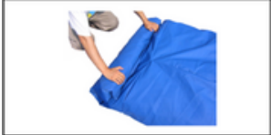
Step 5: Start roll from the front