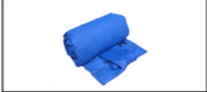
Step 7: Fold in air tubes