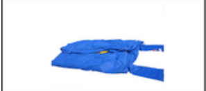
Step 3: Fold in one-fourth from the other side